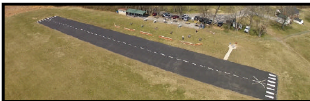
The Field is on Overton Rd off of Neely's Bend in Madison

This event is for ALLAMA Member Pilots and All AMA Safety Code compliant R/C Models Including Turbines Electric, Gas or Glow - all are Welcome. Foamies To Giant Scale!