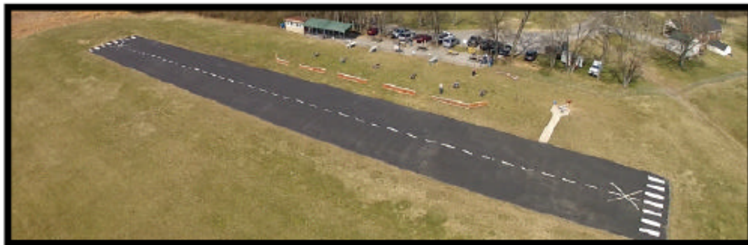
The Field is on Overton Rd off of Neely's Bend in Madison

This event is for ALL AMA Member Pilots and All AMA Safety Code compliant R/C Models Including Turbines